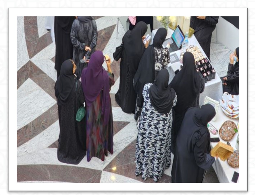
Female students presenting their business concepts

The Showcase Event's success is attributed to the commitment of the course team, collaborative efforts with partners, and steadfast support from Foundation Program management. Looking forward, the Business English course team plans to elevate the caliber of student business ideas, helping them acquire essential QU graduate attributes (particularly fostering creativity and innovation), and to inspire graduating students to embark on their entrepreneurial endeavors.