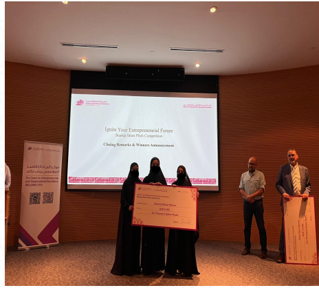
Second place team