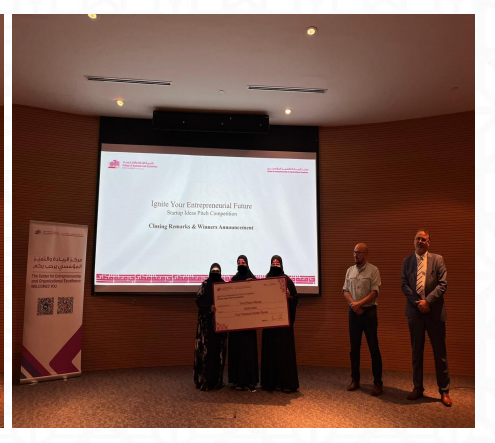
Third place team