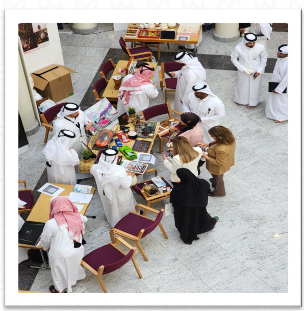
Male students interacting with judges: Photograph courtesy of Conan Kmiecik.