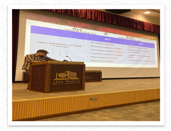
Osama Elhafy presenting ACT and SAT tests: Photograph courtesy of of Mosa Aljumat

Since its launch in April 2019, the Al-Qabas Program has undergone numerous changes and has been delivered in various formats. In April 2019 and 2020, the Al-Qabas Program was organized on campus, bringing students together for five days. In addition to its current topics, it includes college and class visits, and a Poster Showcase prepared by the participating students. Due to the impact of the COVID-19 pandemic, Al-Qabas Program transitioned to a virtual format in June 2021. Subsequently, in November 2022, a hybrid approach was adopted by scheduling concurrent virtual and on-campus sessions. Whether it is face-to-face or online, Al-Qabas Program remains dedicated to bridging the gap between school and university life, thereby contributing to the wider Qatari community, and enhancing student success.