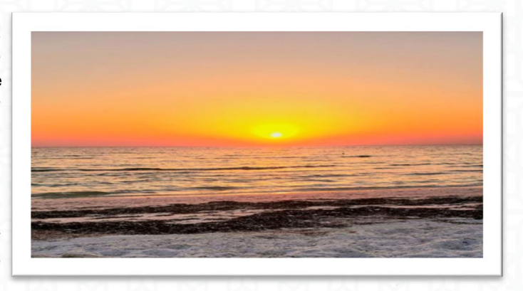
Sunset on the beach

The Foundation Program Students' Affairs Office held the moment to pause from life's distractions. In his words, "the