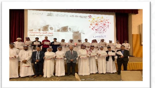
High school students participating in Al-Qabas Program: Photograph courtesy of Mosa Aljumat

The event took place on November 6<sup>th</sup> and 7<sup>th</sup>, 2023 and 357 high school students from 39 schools participated in the program.